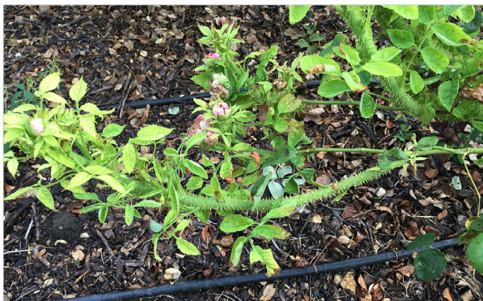
Figure 4. A less common version of RRV infection. There is no redness on the plant, but a long, lateral cane sticks out from the rest of the plant. The cane also has leaf yellowing, witches' broom, and abnormal thorniness.