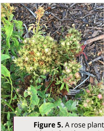
Figure 5. A rose plant with witches' broom in the blooms, elongated or "strapped" leaves, and unusual redness on the leaves. Source: Maddi Shires, Texas A&M AgriLife Extension Service

Source: Maddi Shires, Texas A&M AgriLife Extension Service