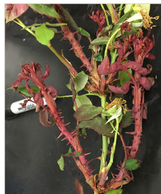
Figure 2. Typical rose rosette symptoms.

Some of the more typical symptoms for RRD include abnormal reddening of leaves and stems, unusual and rubbery thorns, deformed leaves, and witches' broom (multiple stems grow out of one node, causing a bunching effect) (Figs. 2–6).