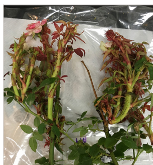
Figure 6. This sample has witches' broom, thickened canes, abnormal redness on the leaves, "strapped" leaves, and abnormal, rubbery thorns.