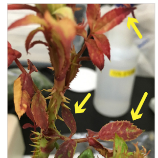
Figure 3. The yellow arrows point to the tie-dyed effect common on roses infected with RRV.